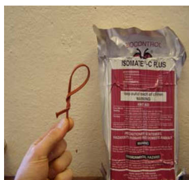
◀ Photo 6. For this trial, Isomate C-Plus pheromone emitters were hung at a density of 400/ac. The emitters are single tubes that are wrapped around or twisted into a loop and hung on branches.