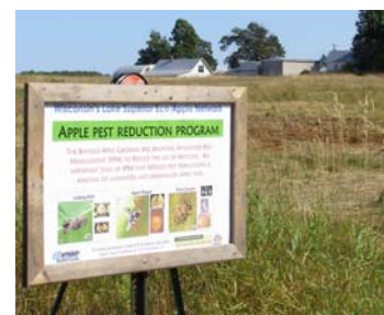
▲ Photo 4. The Apple Pest Reduction Program in the Bayfield area has helped remove unwanted apple trees and reduced the codling moth pest populations.