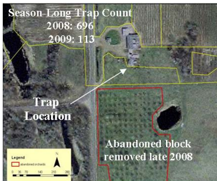
▲ Photo 5. Removing abandoned blocks of trees such as the one outlined in red can greatly reduce pest pressure in adjacent orchards. The trap count in the orchard to the north of the abandoned block was 696 in 2008 when the trees were still standing and only 113 in 2009 after they were removed. No pheromone disruption was used in this part of the orchard.