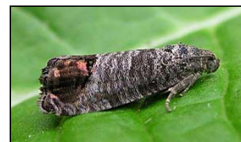
▲ Photo 1. The codling moth female lays the eggs and the larvae tunnel into the apples.

For the Bayfield trial, just prior to bloom, the emitters were placed in the three orchards at a rate of 400 emitters per acre. The emitters are thin tubes that can be wrapped around branches or twisted into a loop and hung on branches. Because most codling moth mating activity occurs in the top third of the tree it is important to place the emitters as high up in the tree as possible. Table 1 shows the time and costs of deploying the pheromone disruption at the three orchards. Orchards 1 and 2 are high-density blocks with small trees and Orchard 3 has full-sized trees requiring a stick or ladder to hang the emitters.