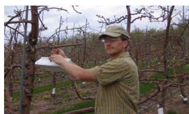
◀ Photo 8. The codling moth traps are hung in the orchard early in the season just prior to bud-break and left there all year.