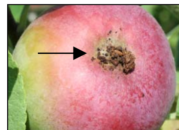
▲ Photo 3. Often the only sign an apple is infested with codling moth larvae is a small hole with frass, usually at the calyx end of the apple.