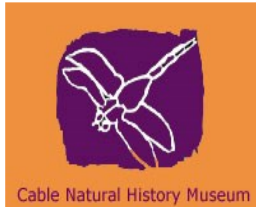
Cable Natural History Museum