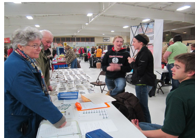
4H Ambassadors greeted visitors and Alumni as they took a trip down memory lane looking at historic 4H photos.