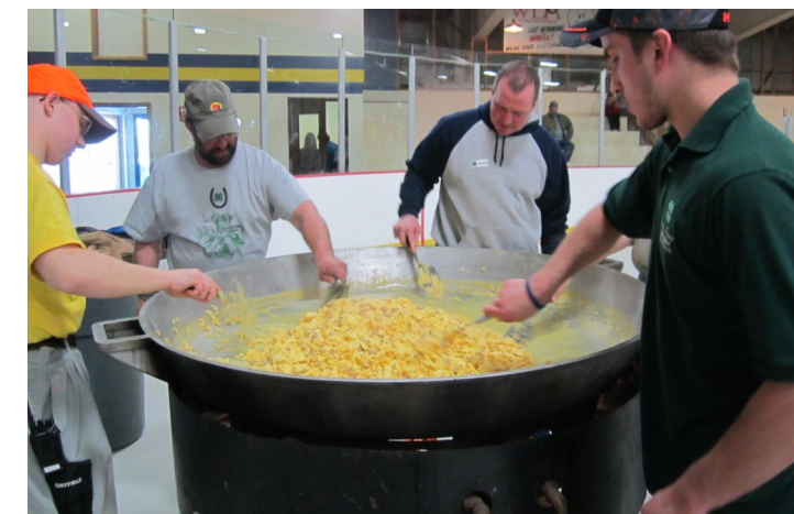
Cooks stirring the eggs, cheddar cheese, ham, onions and mushrooms for the delicious giant omelet.